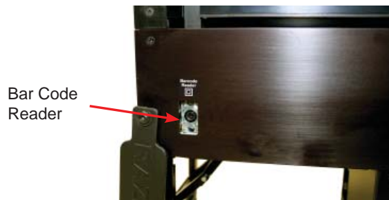
Square Protocol Bar Code