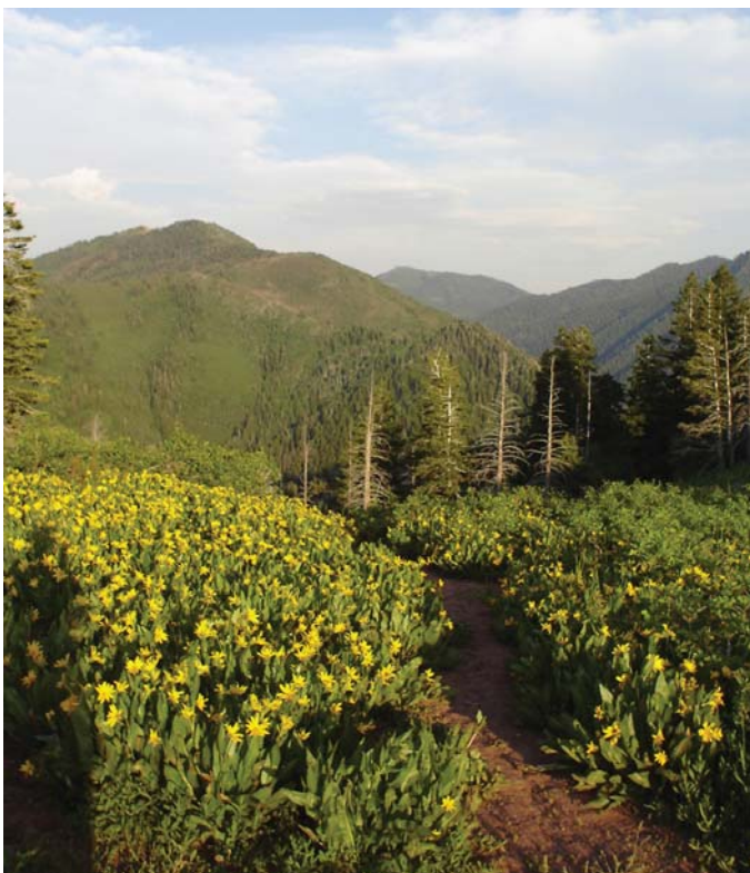
Upper Millcreek Canyon