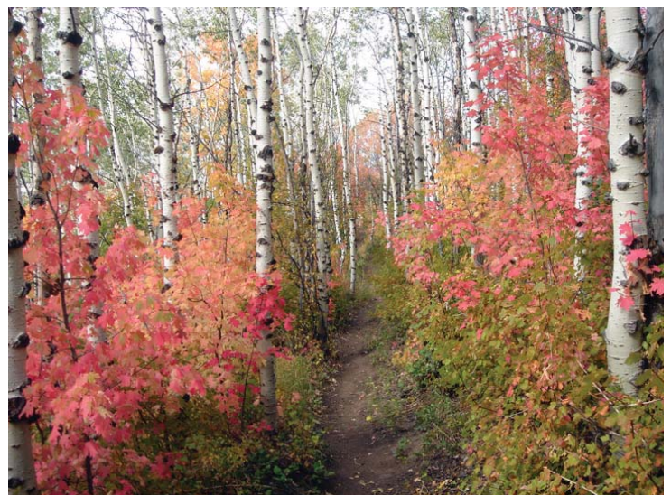
Trail Near Pinebrook